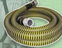
Description Light Bulk Material Handling Applications