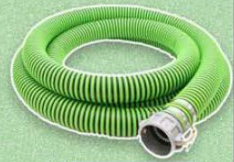
Description Water Suction and Discharge Hose