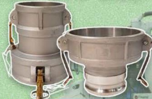
Description Camlock Reducers