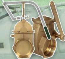
Description Brass Gate Valves